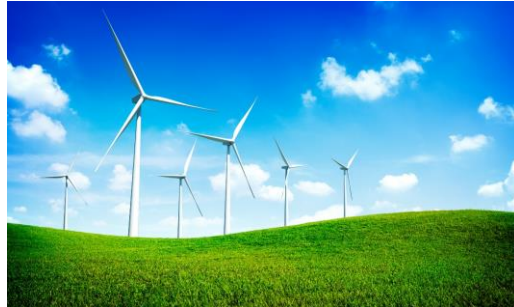
Figure 1: Legend for figure 1